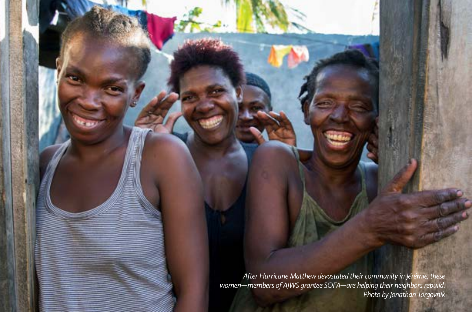
After Hurricane Matthew devastated their community in Jérémie, these women—members of AJWS grantee SOFA—are helping their neighbors rebuild.