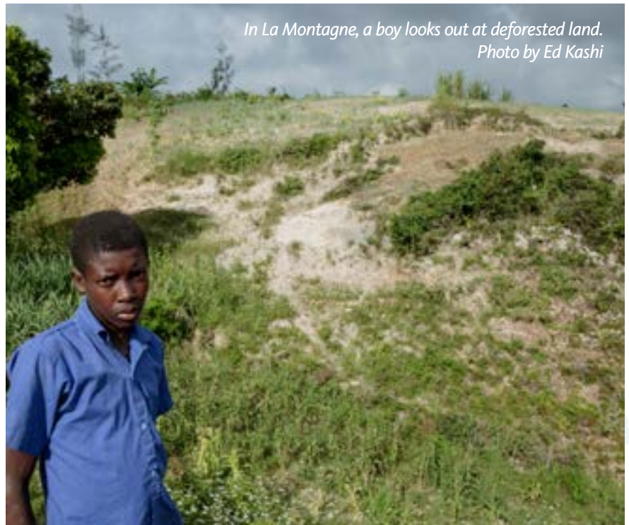
In La Montagne, a boy looks out at deforested land.

In January 2010, a 7.0 magnitude earthquake shook Haiti. It killed more than 200,000 people, injured hundreds of thousands and devastated the capital city of Port-au-Prince. The world watched as the country collapsed, and Haiti's