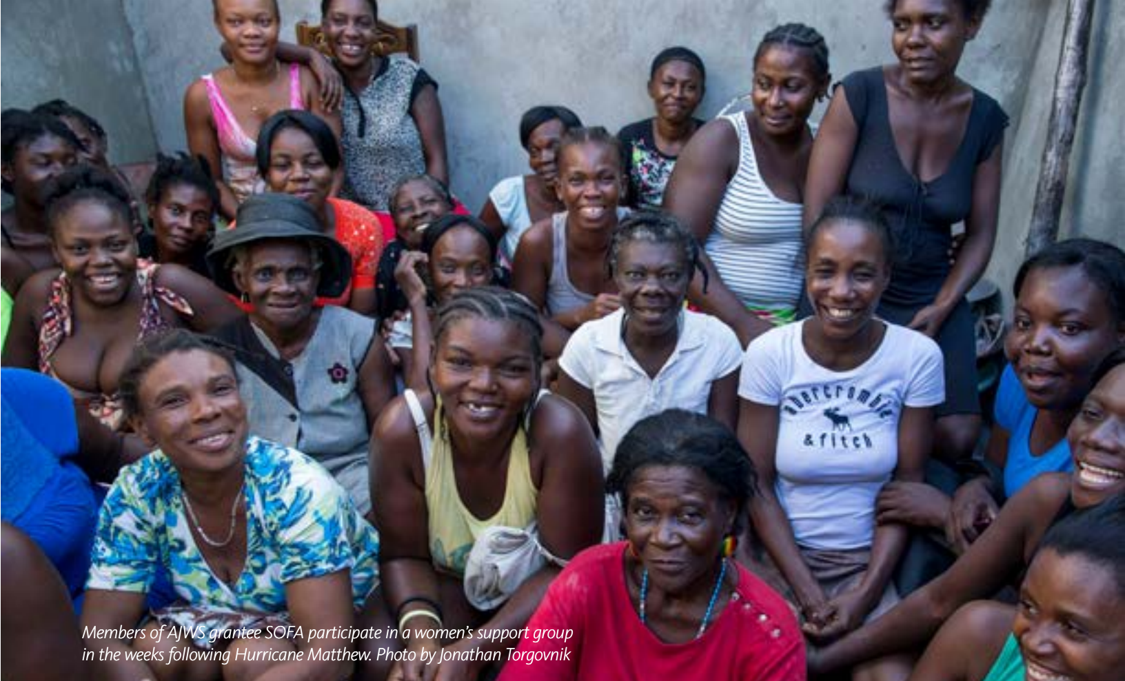
Members of AJWS grantee SOFA participate in a women's support group in the weeks following Hurricane Matthew.