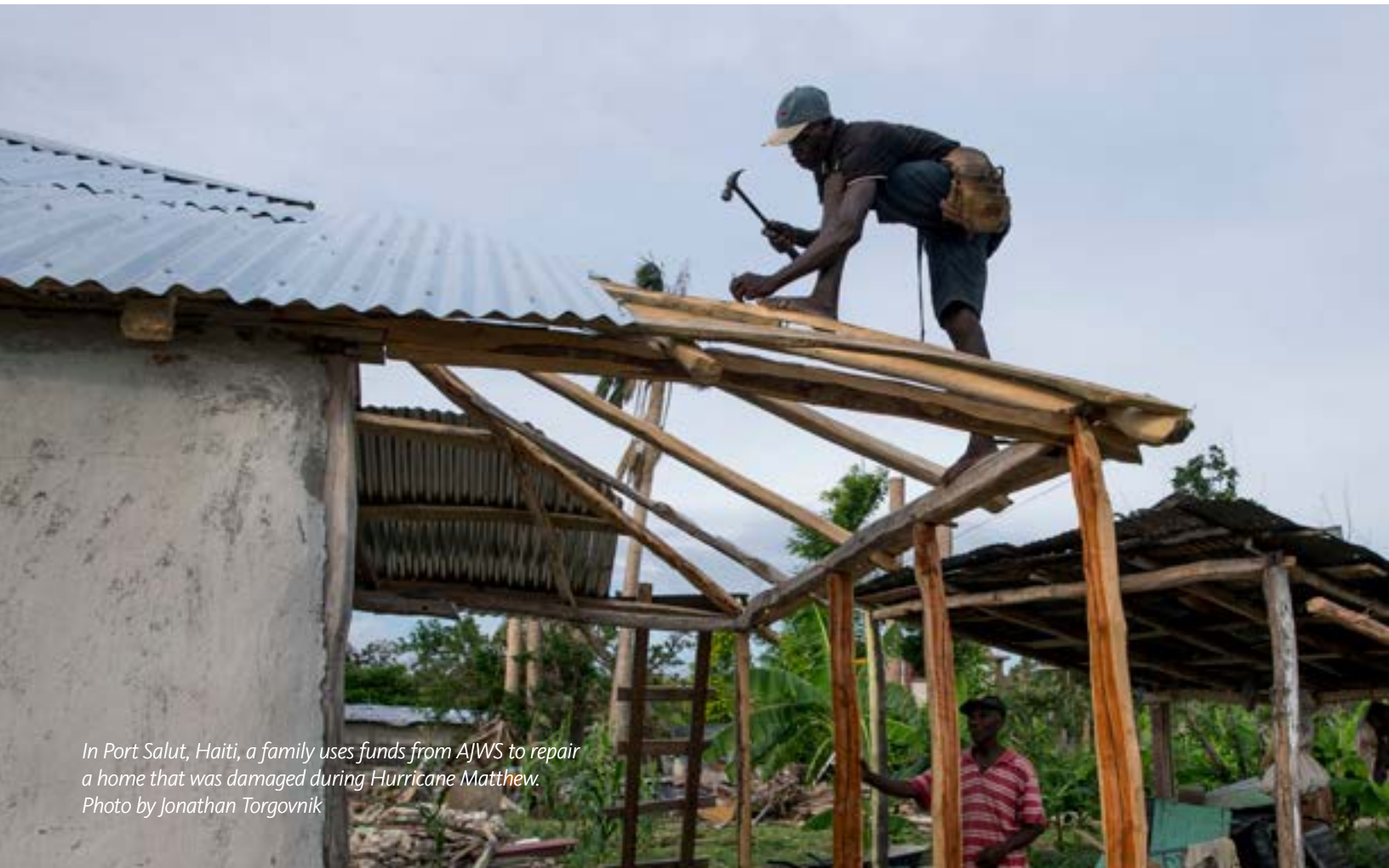
In Port Salut, Haiti, a family uses funds from AJWS to repair a home that was damaged during Hurricane Matthew.