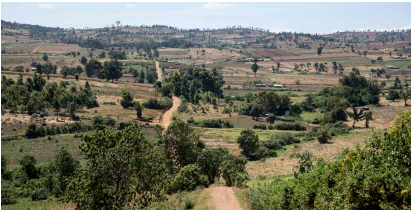
A view of Kenya’s Great Rift Valley.

Among human rights and civil society groups, Ruto is being watched with a great degree of caution. Ruto and his family are religious fundamentalists with a well-documented history of homophobia, and most activists are wary that he will continue the authoritarianism that marked Kenyatta’s rule. Still, it remains to be seen whether Ruto will reinforce Kenyatta’s repressive trends or chart a better path.