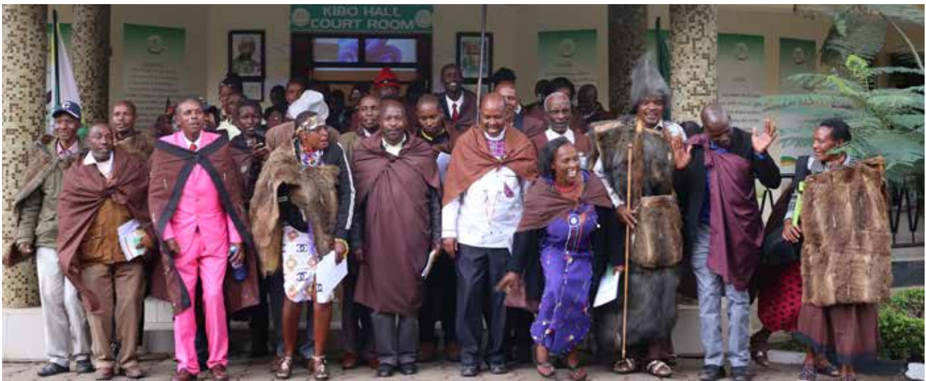
Ogiek people celebrate outside of the Africa Court of Justice in Arusha after receiving their long-awaited reparations verdict in 2022.

Several AJWS grantees have led a successful resistance campaign against a major coal-fired power plant that was slated to be built in the coastal county of Lamu. The project would have endangered the area's ecosystem, threatened the livelihoods of fishing communities and polluted the air. AJWS grantees including Save Lamu , Katiba Institute and Natural Justice joined forces in 2016 to help create deCOALonize , a coalition of organizations turning