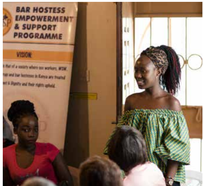
Members of the Bar Hostess Empowerment and Support Programme present on their work to ensure the health, safety and dignity of sex workers in Kenya.

To end discrimination against sex workers and promote their wellbeing, AJWS grantee Bar Hostess Empowerment and Support Programme is ensuring that sex workers have access to justice, support and health care. Since 2013, the organization has successfully represented hundreds of sex workers who were arrested by police for small offenses like loitering, but then charged with prostitution. To pursue broader