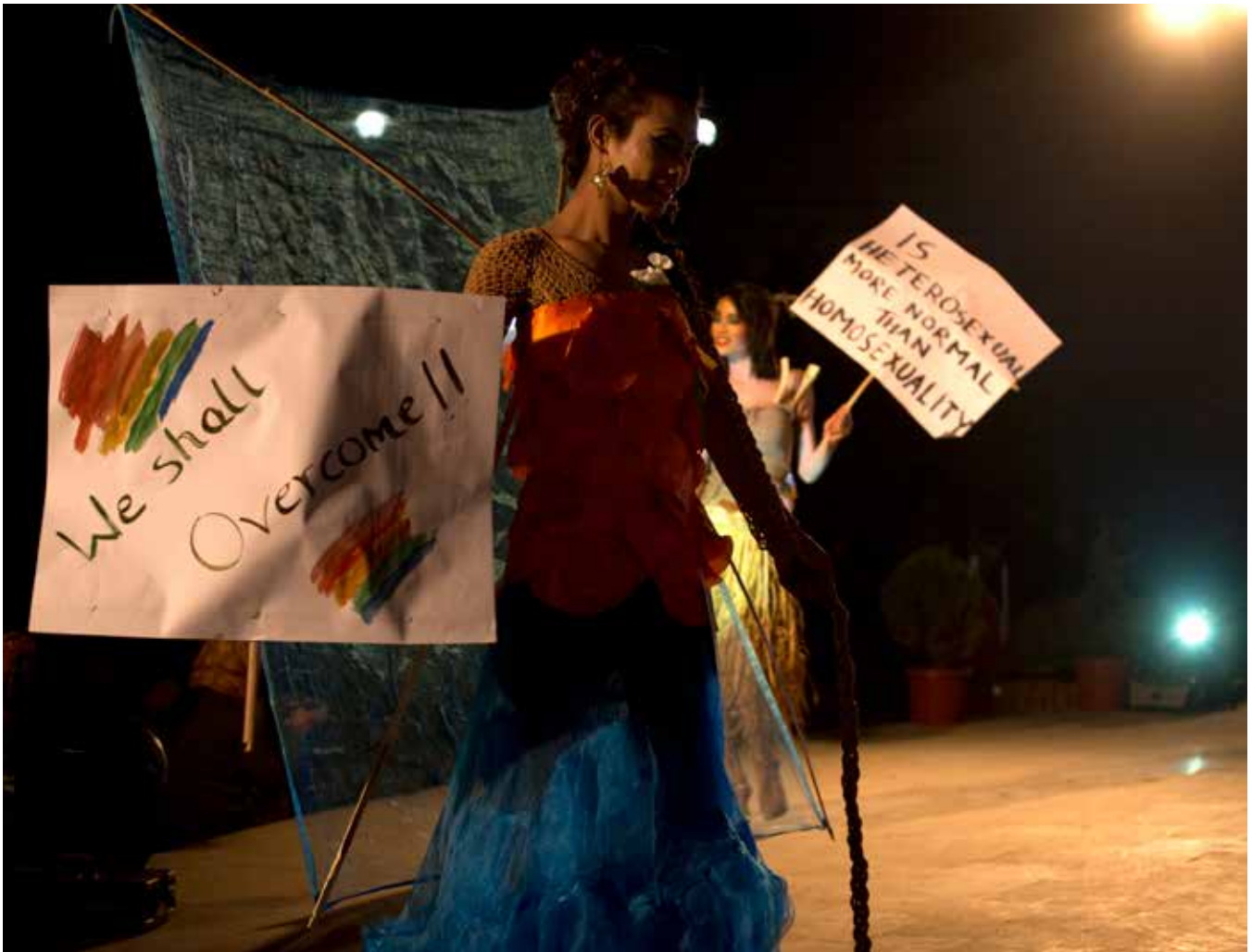
Contestants for the 2013 Miss Transgender Queen for North East India Pageant in Manipur, which SAATHIII helped organize to call attention to LGBTI rights.