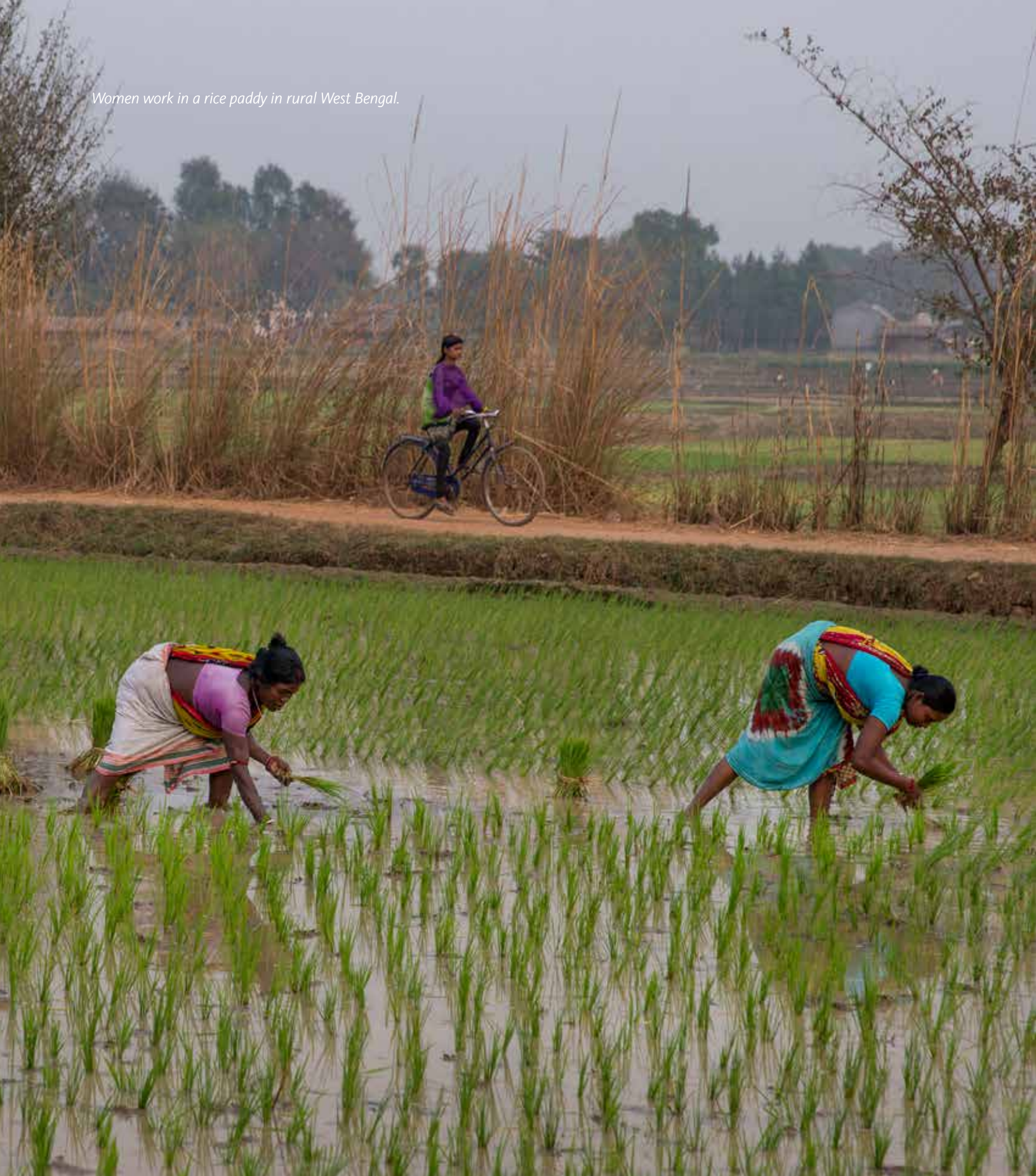
Women work in a rice paddy in rural West Bengal.

LOCATION: Based in Telangana 2017 ORGANIZATIONAL BUDGET: $175,000 AJWS FUNDING HISTORY: $30,000 total since 2016