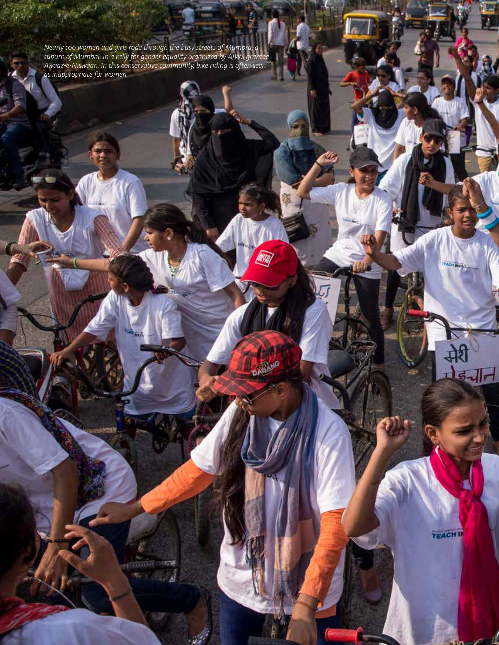
Nearly 100 women and girls rode through the busy streets of Mumbai, a suburb of Mumbai, in a rally for gender equality organized by AJWS grantee Awaaz-e-Niswaan. In this conservative community, bike riding is often seen as inappropriate for women.