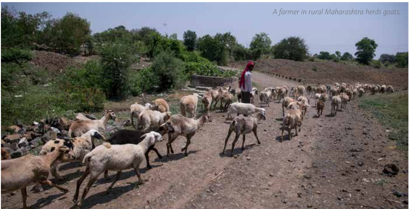
A farmer in rural Maharashtra herds goats.

Yakshi works with rural, indigenous communities in Telengana, training them to advocate for their rights to the forests where they have lived for centuries and the natural resources that they depend on. As a result of Yakshi's educational efforts, many small villages have shifted from growing cotton to producing traditional, local crops. Yakshi has supported women, in particular, to take on leadership roles in this initiative. For example, in an effort to diversify their food crops and preserve local species of plants that might have gone extinct otherwise, more than 180 women have collected and shared over 2,000 pounds of unique seed varieties with villagers in other districts—ensuring that these rare crops will thrive and benefit farmers across the region.