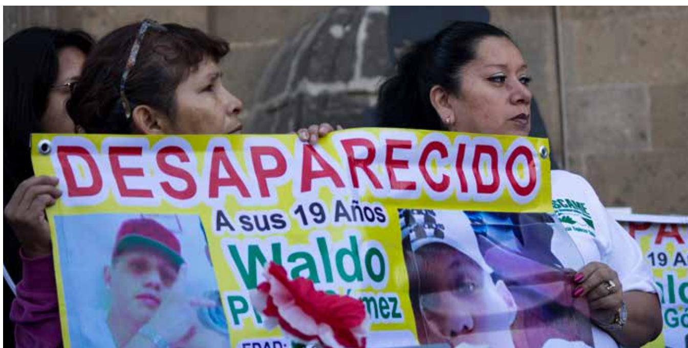
On International Day of Victims of Forced Disappearances, hundreds of bereaved mothers and activists marched in Mexico City. Carrying a petition bearing 100,000 signatures, they called on the government to search for the bodies of their loved ones who have been disappeared as a result of the “War on Drugs.”

Indigenous Peoples also face other kinds of violence, including dispossession from their lands, the imposition of the massive infrastructure and energy projects on their lands without their consent, a lack of legal representation in their native languages and unequal access to health, education and basic services. In principle, nearly 40% of Mexico's land belongs to Indigenous and peasant communities, who have a