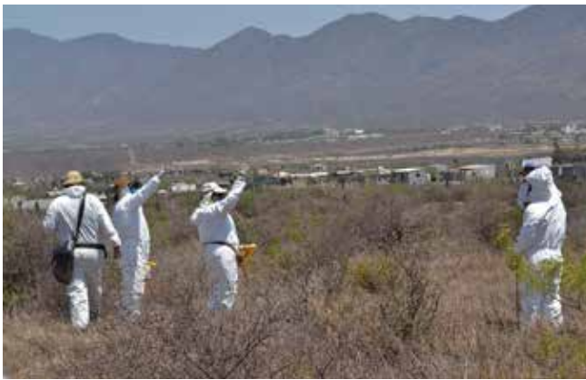
Donning special suits to avoid contaminating the scene, family members of FUNDENL participate in the inspection of a suspected clandestine grave with forensic experts.

families whose loved ones had also been taken—and she decided to start a collective to search and advocate together. That is how Fuerzas Unidas por Nuestros Desaparecidos en Nuevo León (FUNDENL) , or Forces United for Our Disappeared of Nuevo León, was born. FUNDENL has adopted innovative techniques in their searches, using drones and geographic referencing maps to locate human remains, and operating an online database to share findings. Working with forensic anthropologists, archeologists and local police, FUNDENL has found over 100,000 skeletal remains, and they've helped countless families find closure through identifying their loved ones and “returning them home.”