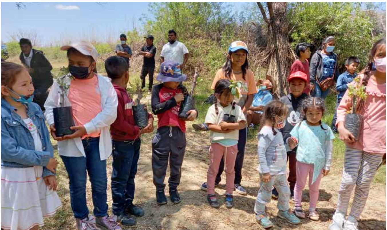
ABOVE Members of AJWS grantee Coordinadora de Pueblos Unidos por el Cuidado y la Defensa del Agua (COPUDA), a collective of 17 Indigenous communities that joined forces to defend their access to water, plant trees to celebrate World Water Day.

Members of colectivos searching for their disappeared loved ones are suffering this violence as well. Many have been targeted while conducting their searches, as they must enter into territories controlled by cartels or organized crime, and some have even been killed.