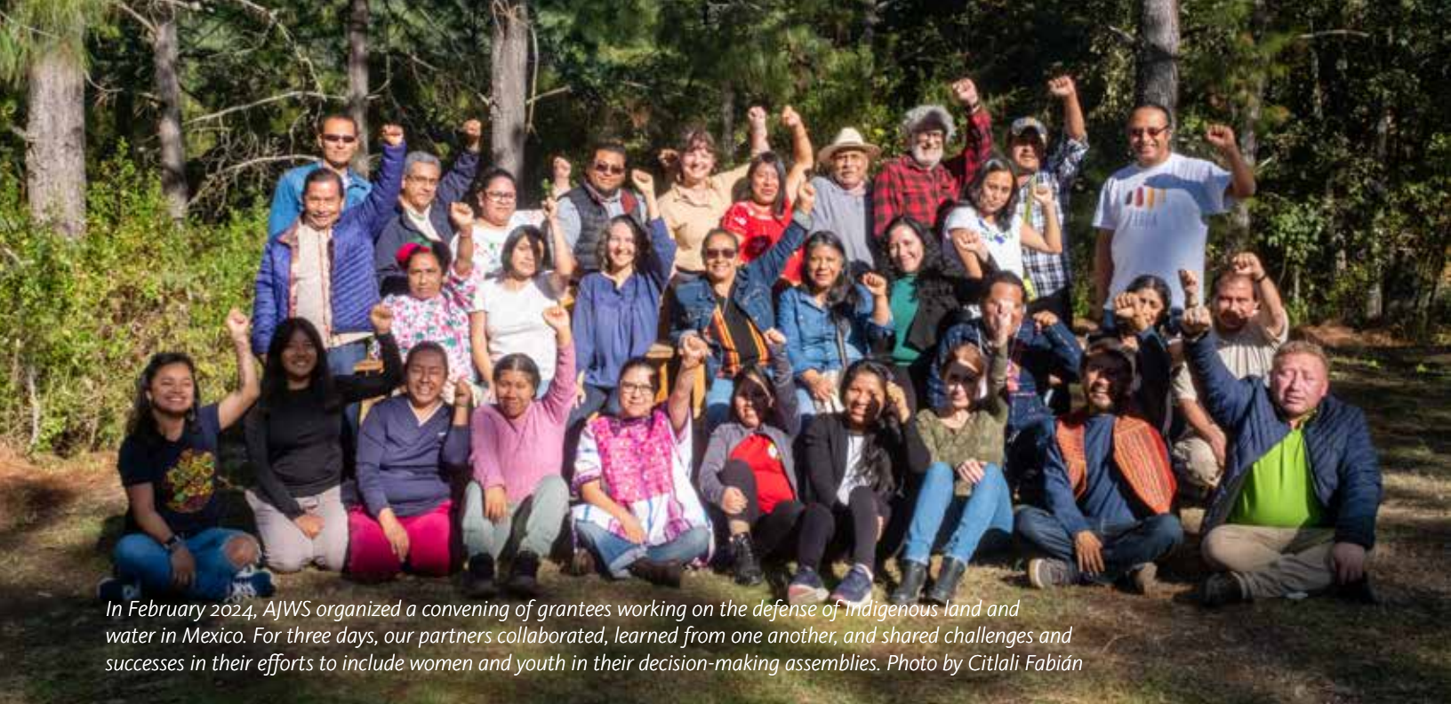
In February 2024, AJWS organized a convening of grantees working on the defense of Indigenous land and water in Mexico. For three days, our partners collaborated, learned from one another, and shared challenges and successes in their efforts to include women and youth in their decision-making assemblies.