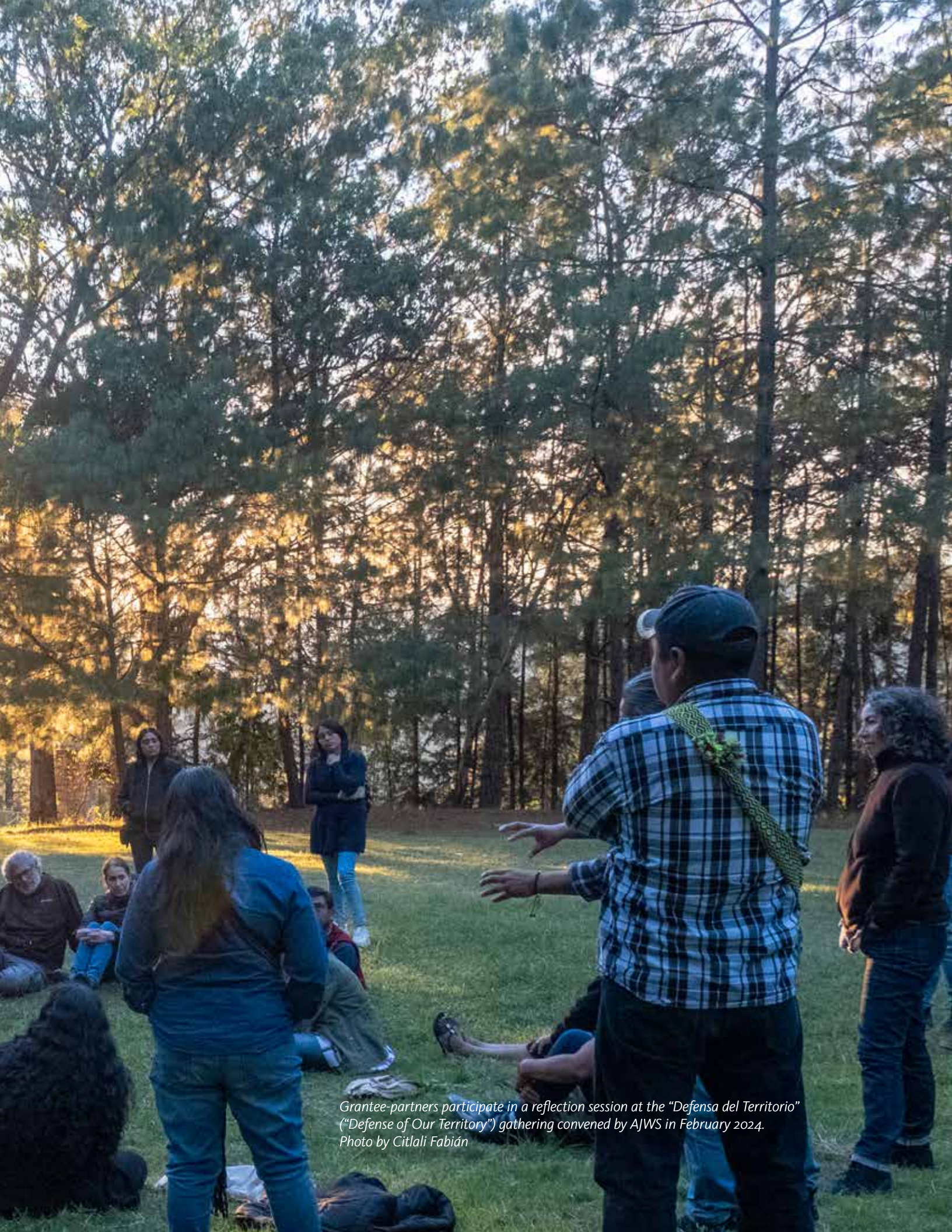
Grantee-partners participate in a reflection session at the "Defensa del Territorio" ("Defense of Our Territory") gathering convened by AJWS in February 2024.