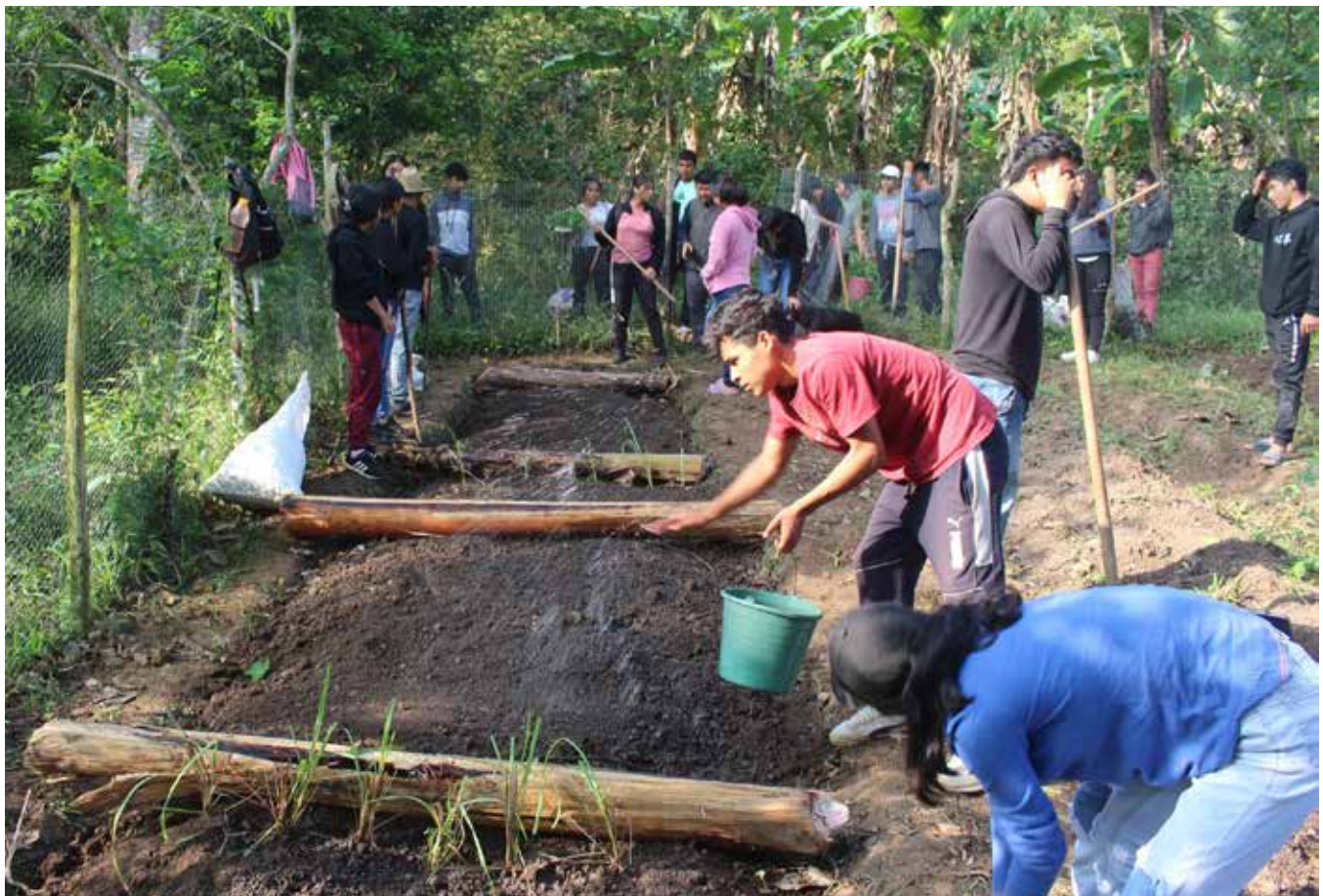
Young members of SER Mixe participate in a training on sustainable agriculture and soil conservation.

To bring about change on a national scale, the Alliance for Self-Determination and Autonomy (ALDEA) was founded to support communities and organizations in their fight for the full recognition of the right to self-determination in the Constitution. Through joint organizing and advocacy, they're currently working to ensure the passage of a congressional bill that would transform the legal framework and guarantee the Mexican State respects and protects Indigenous rights. ALDEA's proposed amendment captures the historical demands of Indigenous Peoples and seeks to give these communities the legal autonomy to fully exercise their right to the self-determination. Currently, a bill presented by President López Obrador, incorporating most of the ALDEA's proposals, is in Congress pending discussion.