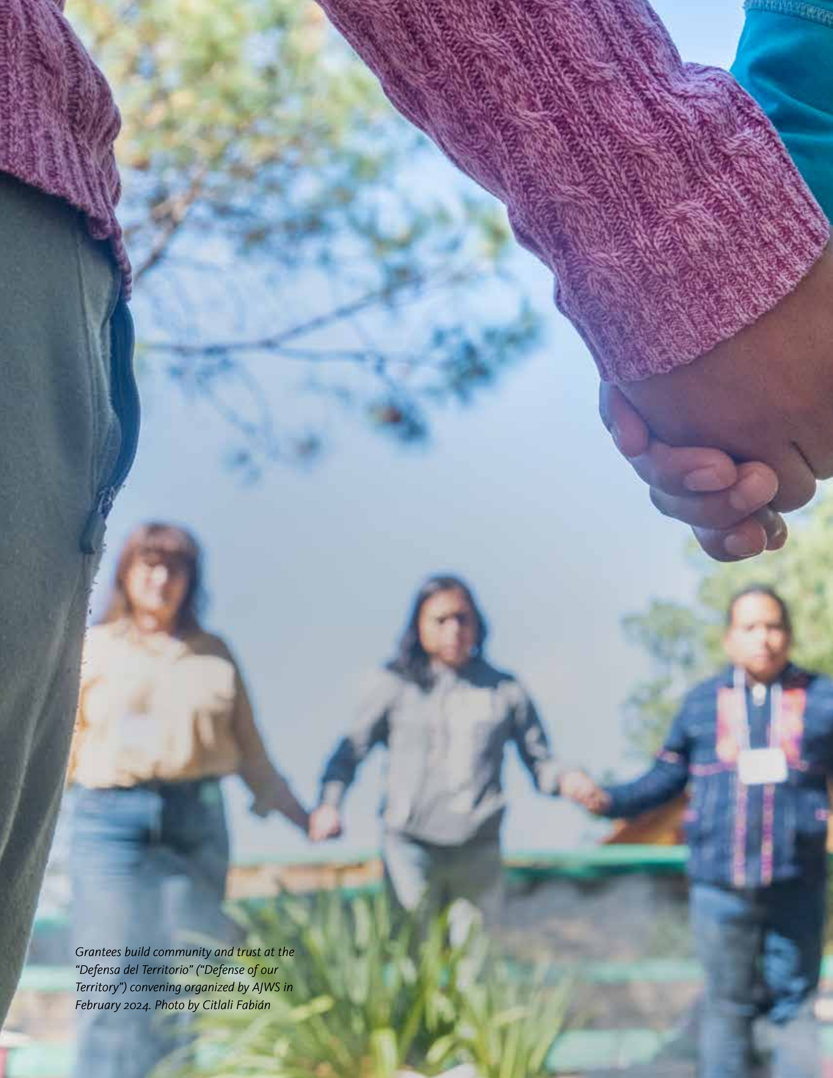
Grantees build community and trust at the “Defensa del Territorio” (“Defense of our Territory”) convening organized by AJWS in February 2024.